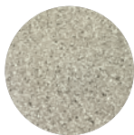
FULL OR PARTIAL FLAKE